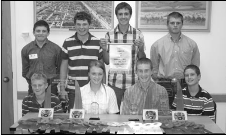
Wallace County Judging Team winning the State Livestock Sweepstakes Contest.