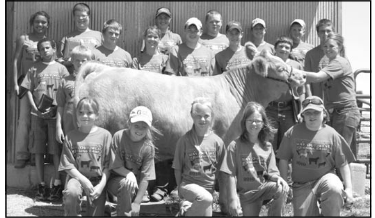
Grund Beef Genetics helped host a Livestock Judging Camp.

We look forward to seeing you on Wednesday, February 23, 2011. If we can be of assistance, feel free to call us.