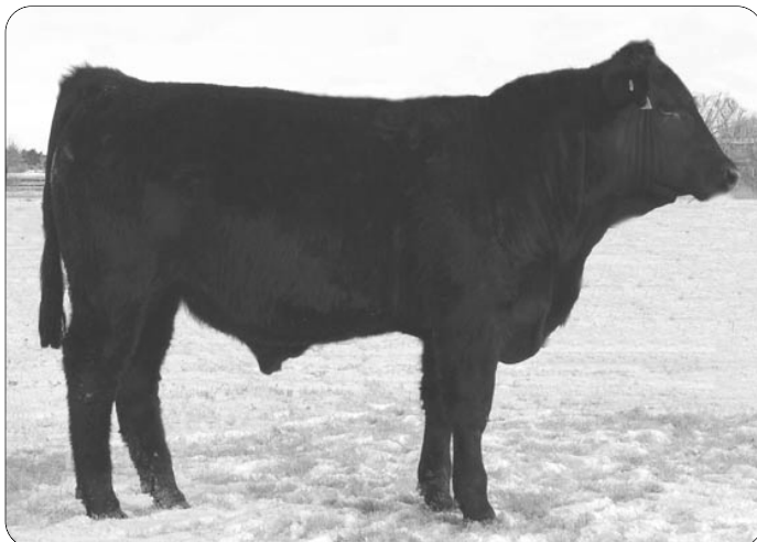
Lot 19 - GRU Mr. Knockout 734X