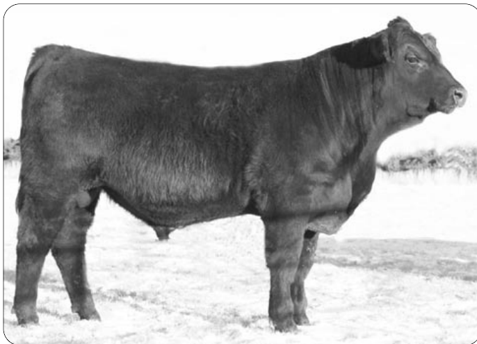
Lot 3 - GRU Mr. Krugerrand 443X

• GRU 202X is a tremendous Red Balancer bull that is nicely balanced, deep ribbed and heavy muscled. Another bull with a great disposition. Dam is a great Good Stuff x Freedom daughter that has produced 2 great calves in her first two years of production. Note the balanced EPD's this bull has for calving ease along with growth. Retaining 50% Semen Interest.