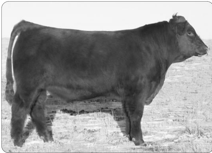
Lot 2 - GRU Chisum 202X

• GRU 850X is a stout, powerful, thick made bull that has a great disposition. 850X ranks in the top 5% of the breed for growth EPD's. This 3/4 blood GV bull stems from the same cow family of the GRU Jake 744J who sold for $10,000 to Elk Creek Gelbvieh. This boy will add pounds to your calf crop and leave you a tremendous set of females.