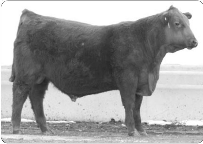
Lot 65 - CAMP 1A Mr. Ribeye X006