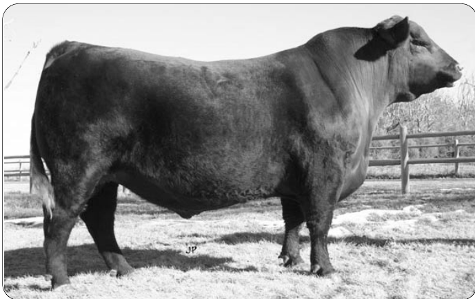
PIE Get Western 4061 For Reference Only - His influence sells.