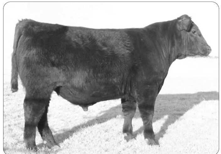
Lot 25 - GRU Mr. Sugar 027X

• GRU 027X is another solid Sugar Ray bull out of a 12 year old cow. 027X is a very nice balanced bull with muscle and rib. Dam has produced many solid bulls throughout the years that all have a great look.