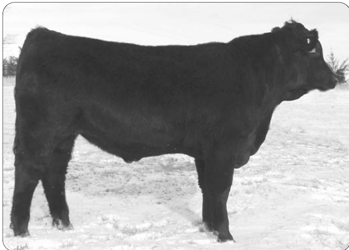
Lot 7 - GRU Mr. Govenor 803X