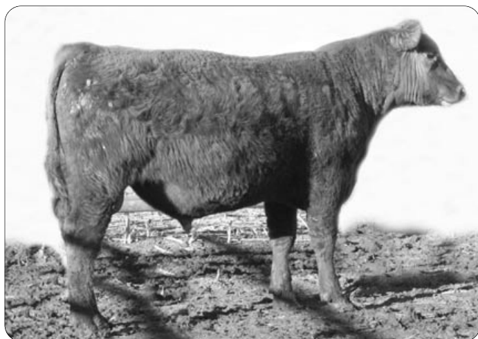
Lot 71 - CAMP 1A Mr. Statement X008

• Camp 1A X022 - Here is another Ribeye T127 son. You can't get a much more solid set of numbers. He will make grid busting steers, awesome replacement heifers, and a very consistent calf crop.