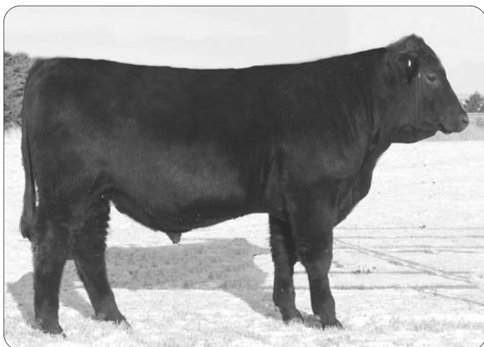
Lot 9 - GRU Mr. Govenor 825X

• GRU 825X is another lower birth weight bull that flat out grew all summer. Great EPD's for birth, growth and carcass traits. We think you will like the Govenor cattle considering their moderate birth weights, exceptional growth and good looks.