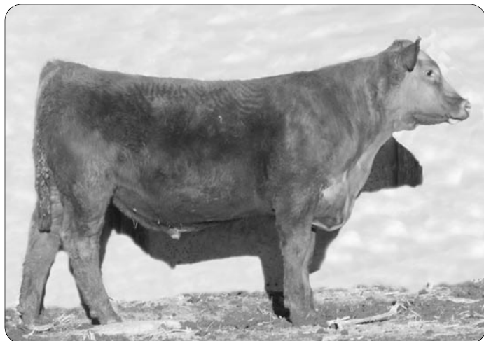
Lot 70 - CAMP 1A Mr. Statement X023