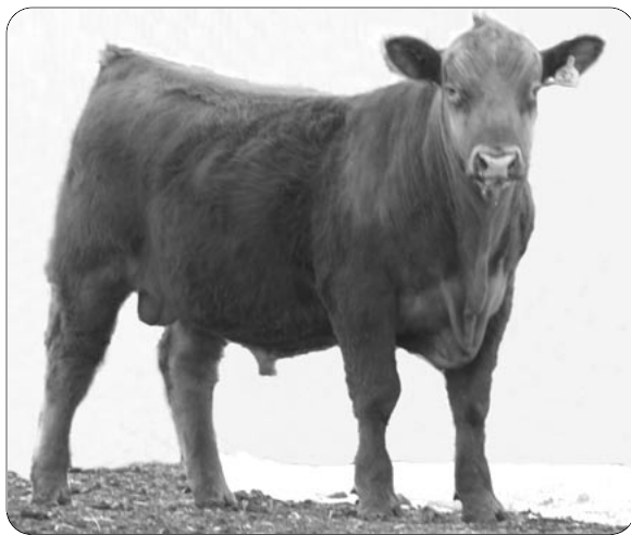
Lot 66 - CAMP 1A Mr. Ribeye X011

• Camp 1A X006 - This is hands down the most powerful bull in the offering. He is a real tank and will no doubt add real muscle shape in your calf crop. He combines moderate birth with excellent growth and a double positive carcass combination of marbling and Ribeye, which is very hard to do. Feeder cattle buyers and cattle feeders are demanding more muscle in their calves. Definate herd sire prospect here.