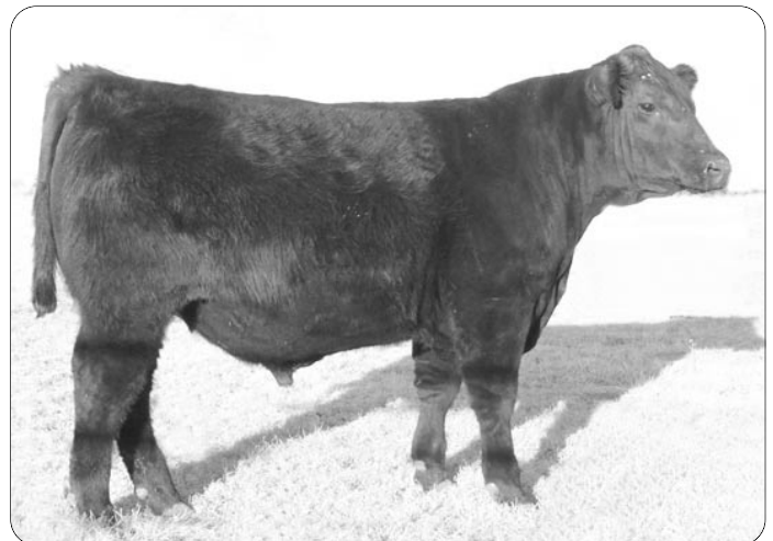
Lot 54 - GRU Mr. Answer 8008X

• GRU 7370X is one stout rascal. This bull will add shape to your calf crop and offers a super set of EPD's for low birth weight and exceptional growth.