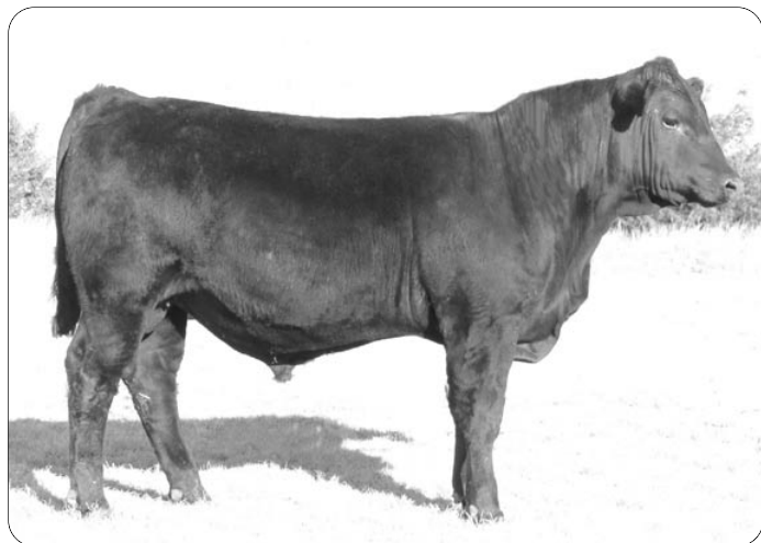
Lot 11 - GRU Mr. Predestined 05X

• GRU 05X is from a great producing cow that is 12 years old that we should have treated a little better considering her age. 05X had a little lighter weaning weight but believe me the genetics are great in this bull. 05X is sired by the great Angus bull Predestined and his dam is a great daughter of Boo Boo. Maternal brothers have been top selling bulls in previous years. Note the low birth weight and great EPD's for growth and carcass traits. Carcass value ranks in the top 2% of the breed!