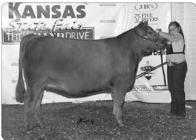
Taryn's Reserve Champion Red Angus Heifer

• Camp 1A X018 - Full sib to X001 (Lot 77), probably the last bull by these two great Red Angus individuals to be available for sale. Birth weight has to be disregarded as they are ET calves raised by commercial recip cows.