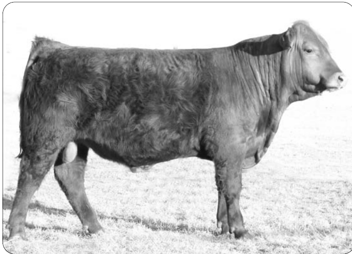
Lot 36 - GRU Mr. Astro 708X