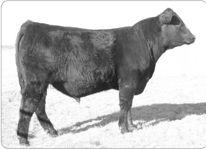
Lot 17 - GRU Mr. Answer 817X