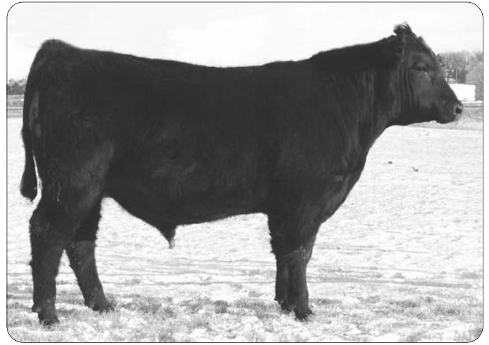
Lot 52 - GRU 7021X

• GRU 7021X is another low birth weight, high growth bull with a great look and a lot of muscle. We are proud of these Angus bulls for their muscle shape, look and EPD's.