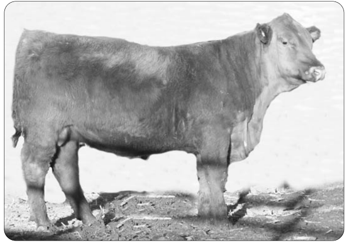
Lot 73 - AKF Delay Canyon

• AKF Delay Canyon - Holy Cow! Here is a picture bull out of the famed Cherokee bull and a Mario cow. This could be the best bull of the sale. I chose him for a picture bull before I knew he had a 55 WW EPD and a 92 YW EPD, and double positive carcass traits. Guys this is a stand out herd bull prospect that can run with any of the best bulls in the country. The dam has a whopping 106 MPPA.