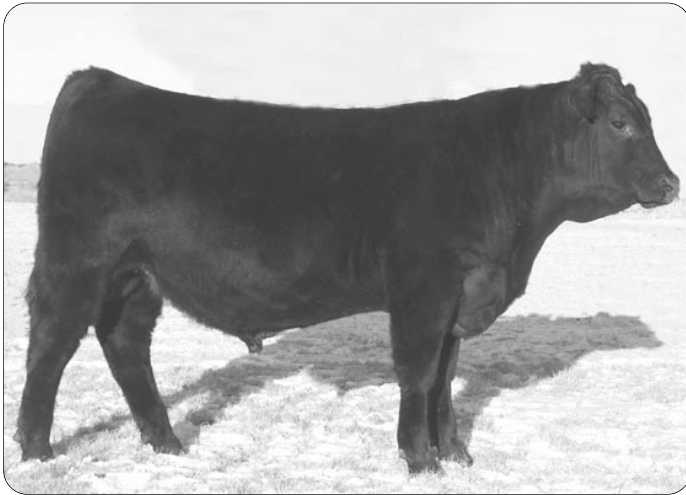
Lot 1 - GRU Impact 850X