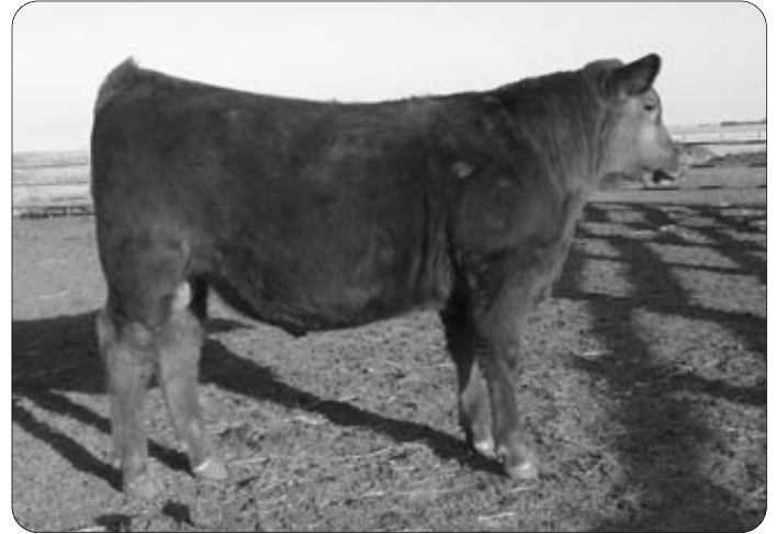
Lot 67 - CAMP 1A Chivalry U829

• Camp 1A Chivalry U829 - Chivalry, the sire of U829, was the 2005 Calf Champion and Reserve Grand Champion Bull at the Nebraska Cattlemen's Classic. He has sired very eye appealing calves for Camp 1A. Most recently one of his daughters was the Champon Red Angus heifer at the Kansas Beef Expo, and she was 2nd in a very tough February class at the 2009 National Western Stock Show. His dam has a 101.7 MPPA and is from the Leachman Olive cow family. He has a very balanced EPD profile that fits the Camp 1A Center breeding program.